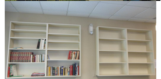
WALL BOOKSHELVES Columbus Room