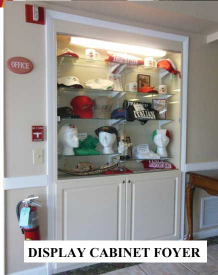
DISPLAY CABINET FOYER