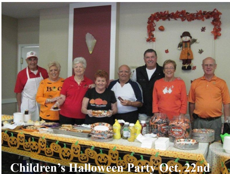
Children's Halloween Party Oct. 22nd